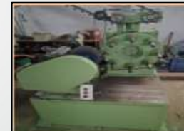
AUTOMATIC BASE COATING MACHINE