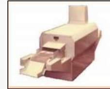
TIT TYPE ANNEALING OVEN