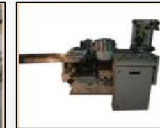
AUTOMATIC TUBE CAPPING MACHINE