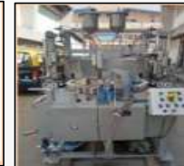
HORIZONTAL LACQUER M/C