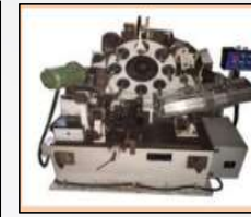
AUTOMATIC TRIMMING M/C