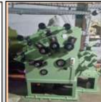
AUTOMATIC 4 COLOR DRY OFFSET PRINTING MACHINE