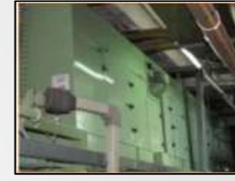
TIT TYPE LACQUER OVEN