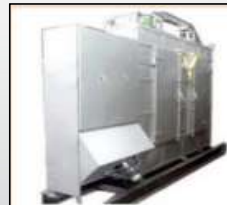
DRYING OVEN COATING M/C