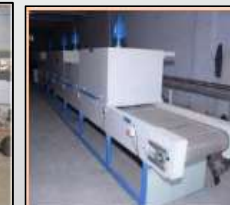
DRYING OVEN PRINTING M/C